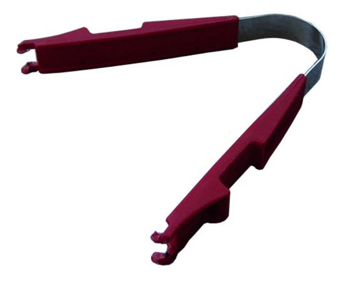
Figure 1: T3000 extraction tool

The T3000 extraction tool can be obtained through Adaptive Micro Systems.