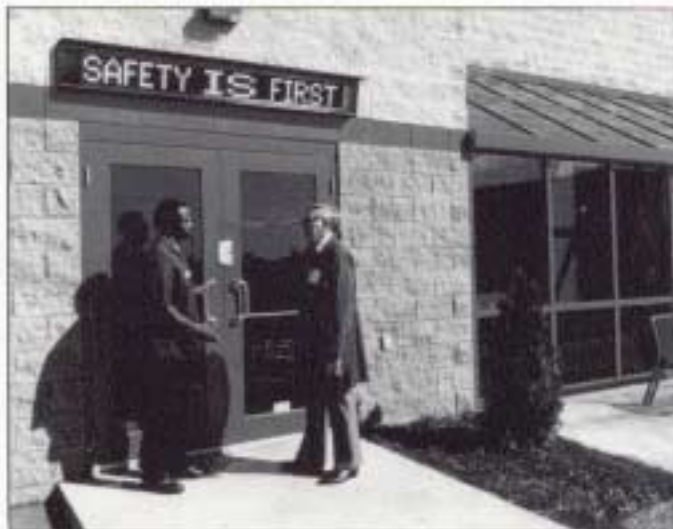
The ALPHA 790i Incandescent Message Center is ideal for business entryways.