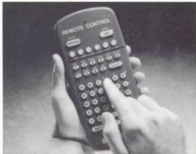
Messages are entered through a wireless remote keyboard.