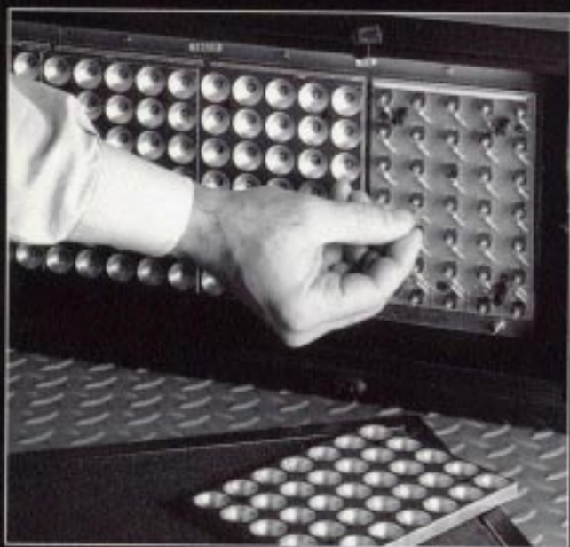
NO TOOLS NECESSARY: Front loading bulb design makes bulb replacement quick and easy.